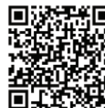
QR code #2 (Central Lodges reservations)